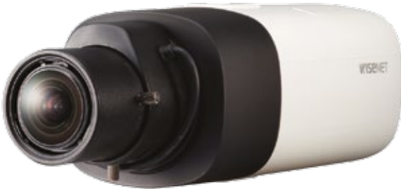
* Lens not included